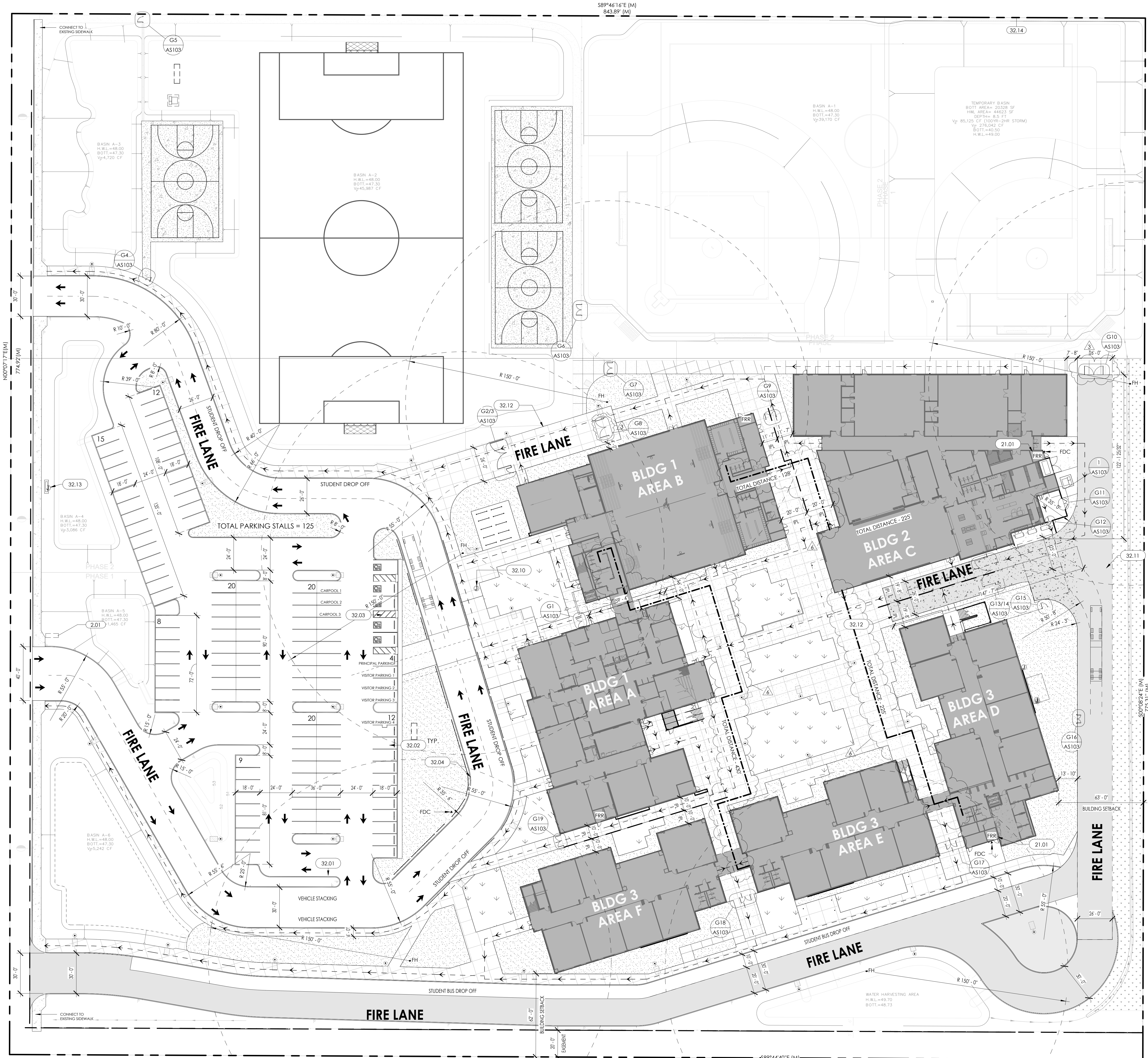
SITE PLAN - OVERALL